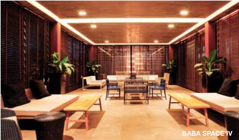
BABA SPACE IV