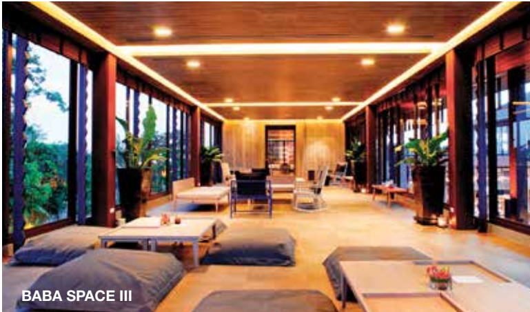
BABA SPACE III