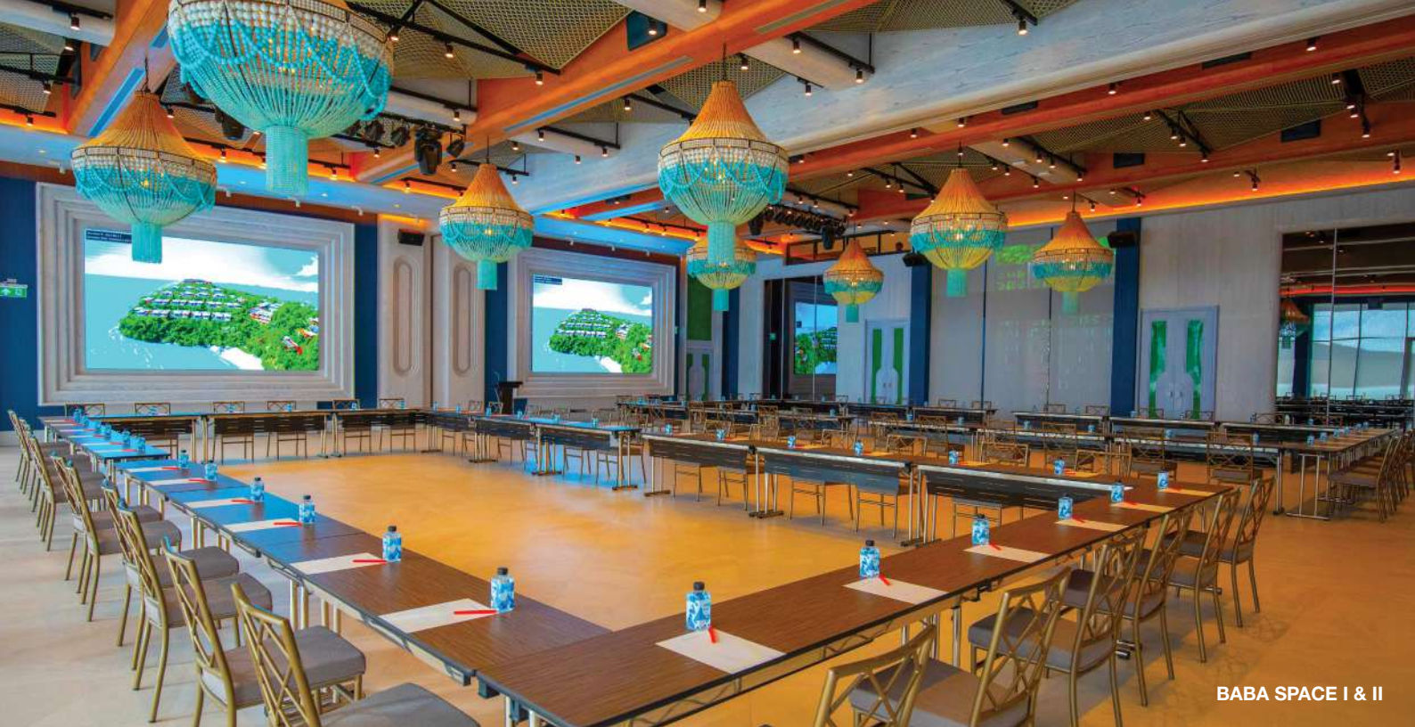
BABA SPACE I & II