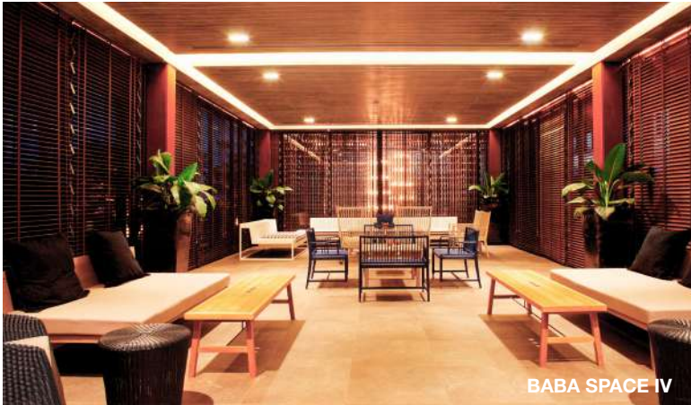
BABA SPACE IV