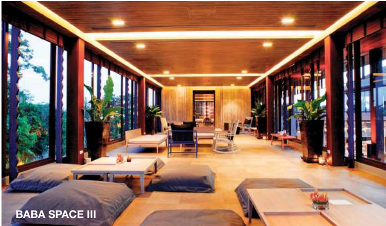
BABA SPACE III