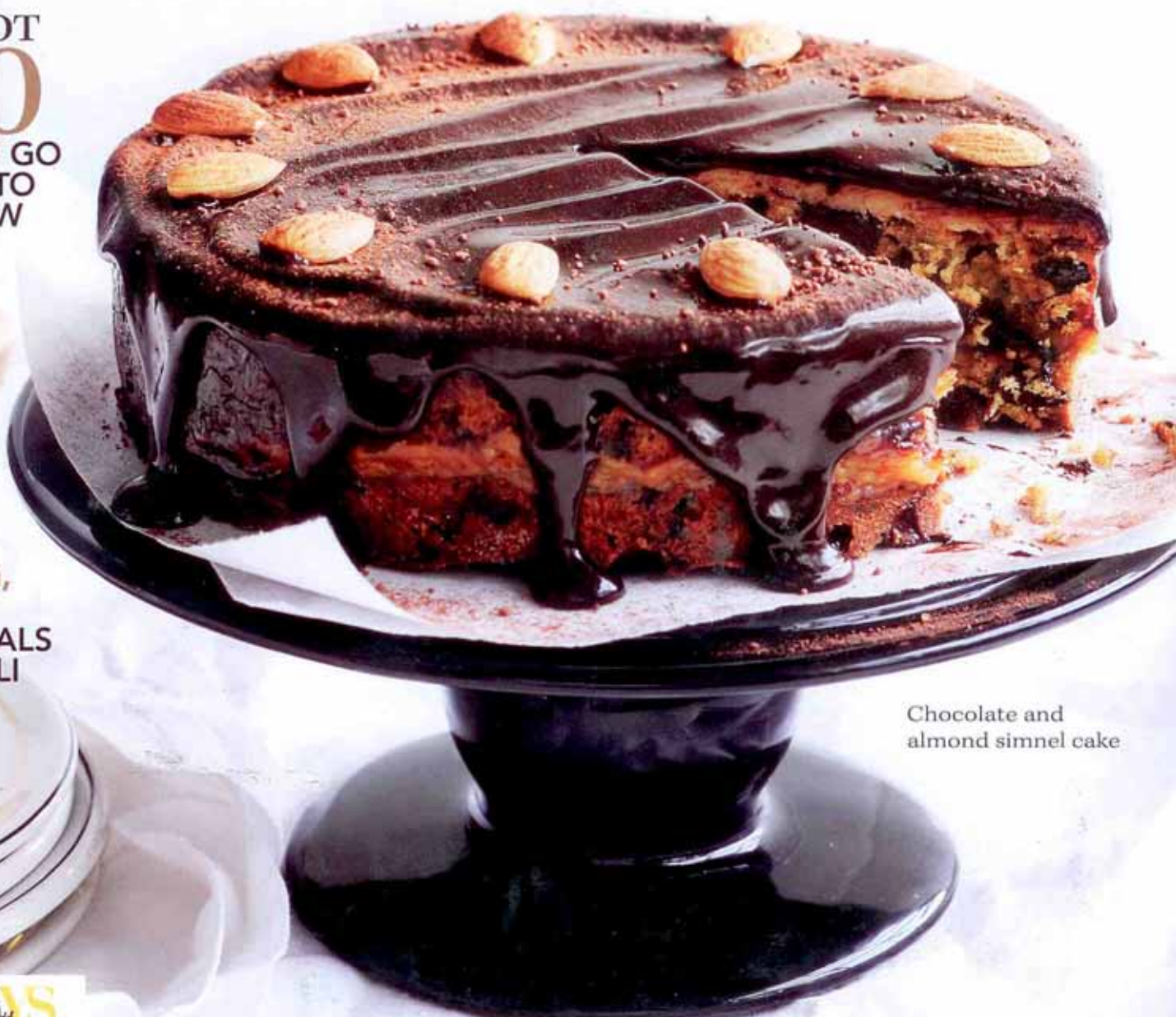
Chocolate and almond simnel cake

WHAT'S COOKING, ERRAN? STAFF MEALS T EL BULLI